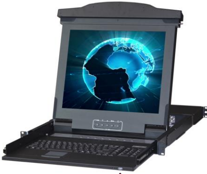
↑ (USB Port for device access)

The Anno range of LCD console drawers provide a variety of features that simplify to access servers to making system monitoring, troubleshooting and software upgrades.